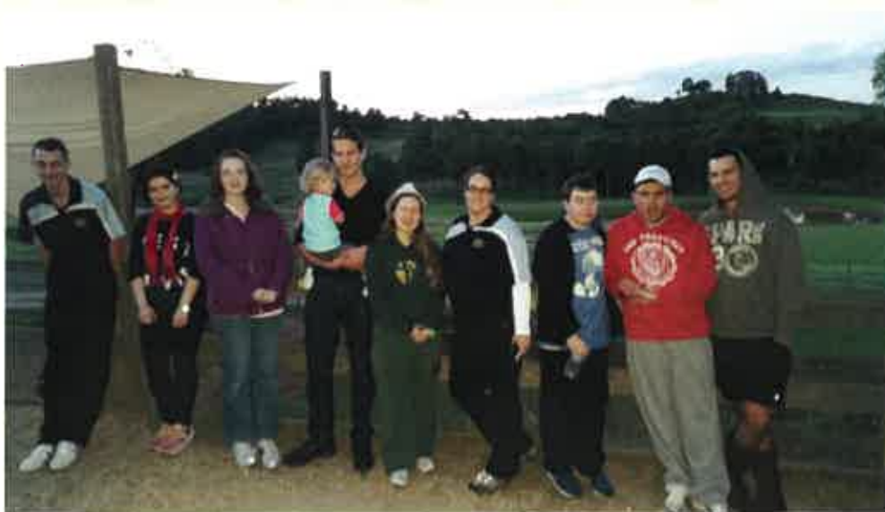
The Social Group at their overnight camp at Calmsley Hill City Farm