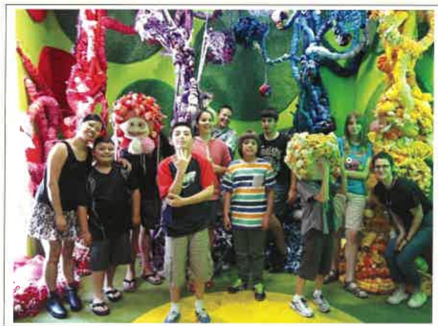
Outing at the Museum of Contemporary Art