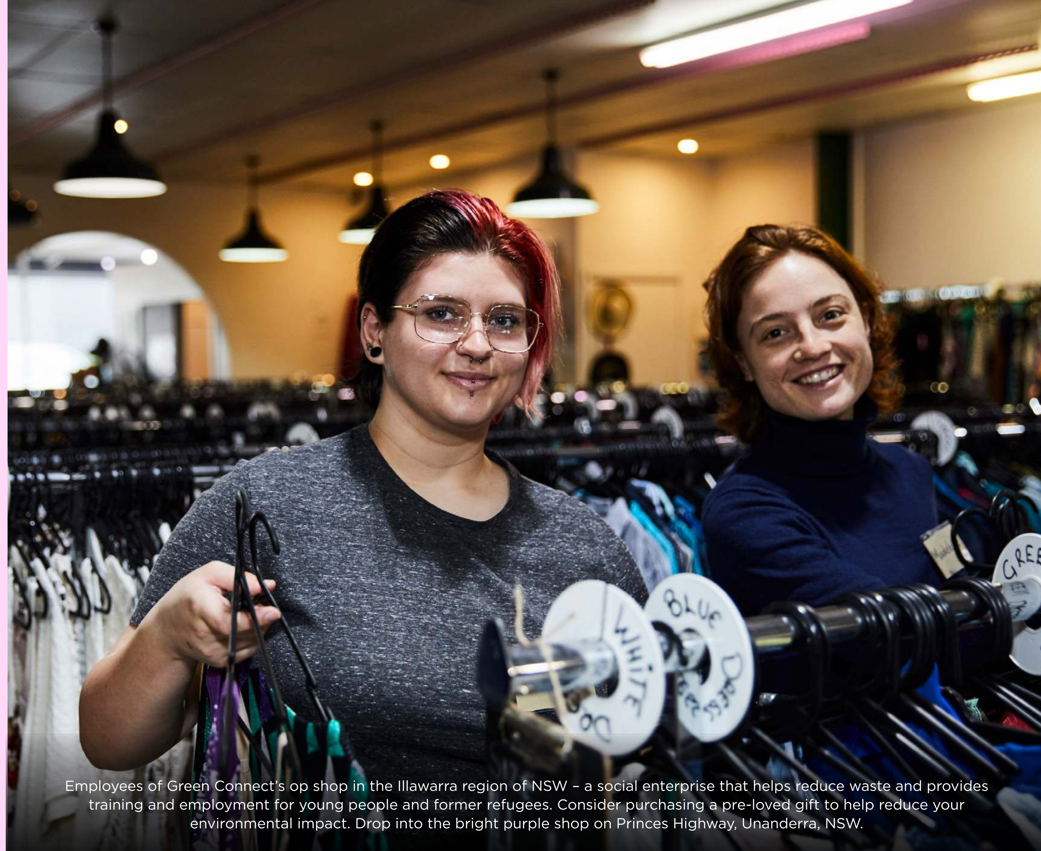
Employees of Green Connect's op shop in the Illawarra region of NSW – a social enterprise that helps reduce waste and provides training and employment for young people and former refugees. Consider purchasing a pre-loved gift to help reduce your environmental impact. Drop into the bright purple shop on Princes Highway, Unanderra, NSW.

They operate in all sectors of the community from retail to catering and hospitality, and what makes them unique is that they exist to create impact through trade.