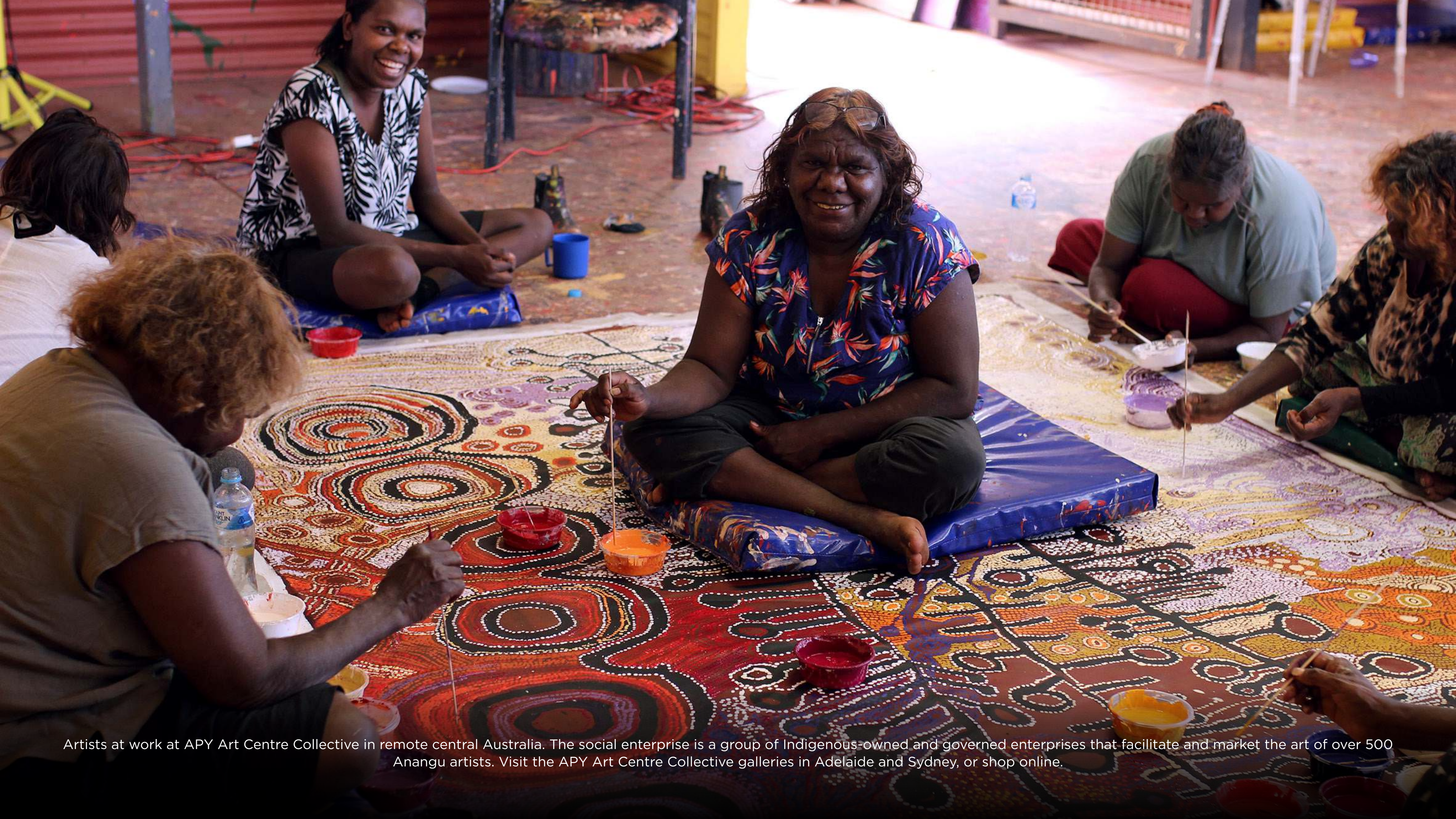
Artists at work at APY Art Centre Collective in remote central Australia. The social enterprise is a group of Indigenous-owned and governed enterprises that facilitate and market the art of over 500 Anangu artists. Visit the APY Art Centre Collective galleries in Adelaide and Sydney, or shop online.