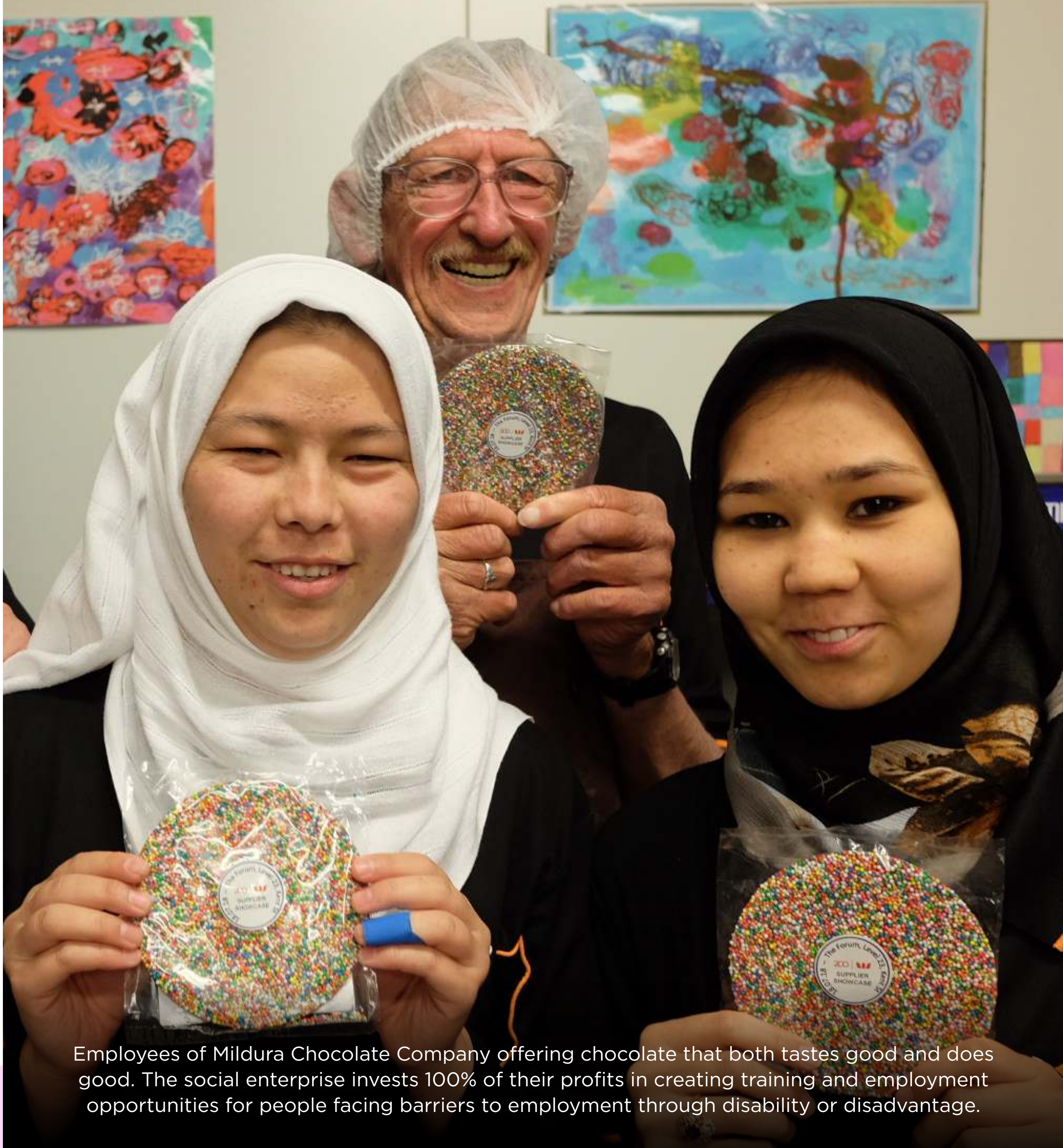
Employees of Mildura Chocolate Company offering chocolate that both tastes good and does good. The social enterprise invests 100% of their profits in creating training and employment opportunities for people facing barriers to employment through disability or disadvantage.